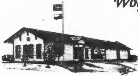
Wolfe City Public Library Wolfe City, Texas

204 E. Williams P.O. Box 109 Wolfe City, Texas 75496 Wfclibrary496@att.net